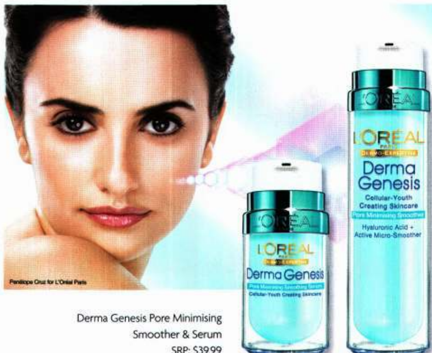
Derma Genesis Pore Minimising Smoother & Serum SRP: $39.99

The L'Oréal Paris Derma Genesis range has been extended to include Derma Genesis Pore Minimising Smoother & Serum, star products for women who are longing for refined pores and smoother, younger looking skin. L'Oréal Paris was 1st to market in 2008 with Hyaluronic Acid, a powerful moisturising agent, now seen in a number of competitor products. Derma Genesis Pore Minimising Smoother is a unique combination of Hyaluronic Acid, Pro-Xylane & Active Micro-Smoother to tighten and refine pores, for smoother looking skin. With a 250,000 sampling campaign, and TV & Print in July featuring Penelope Cruz, New Zealand women won't miss this innovation.